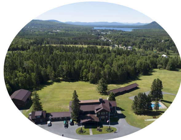
Skylodge Moose River, ME