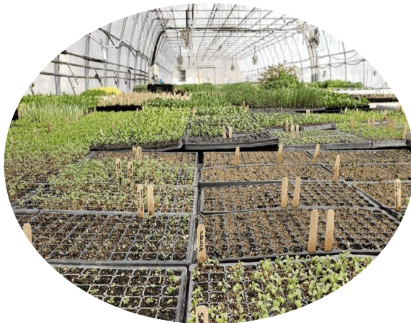
McKay Farms & Research Station Thorndike, ME