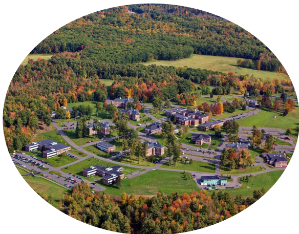
Pineland Farms New Gloucester, ME