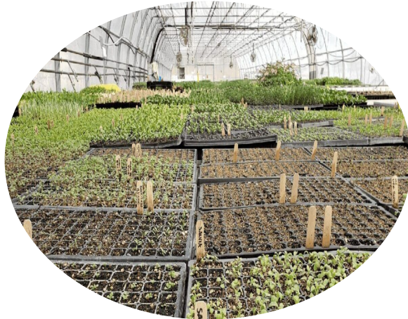
McKay Farms & Research Station Thorndike, ME