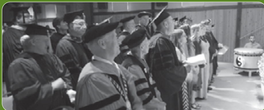
Distinguished guests came from near and far.