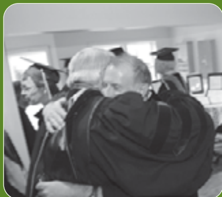
Lapping and Thomashow share a hug.