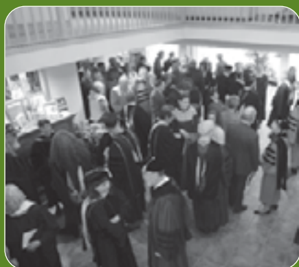
Guests in colorful academic regalia mingle after the inaugural ceremony.