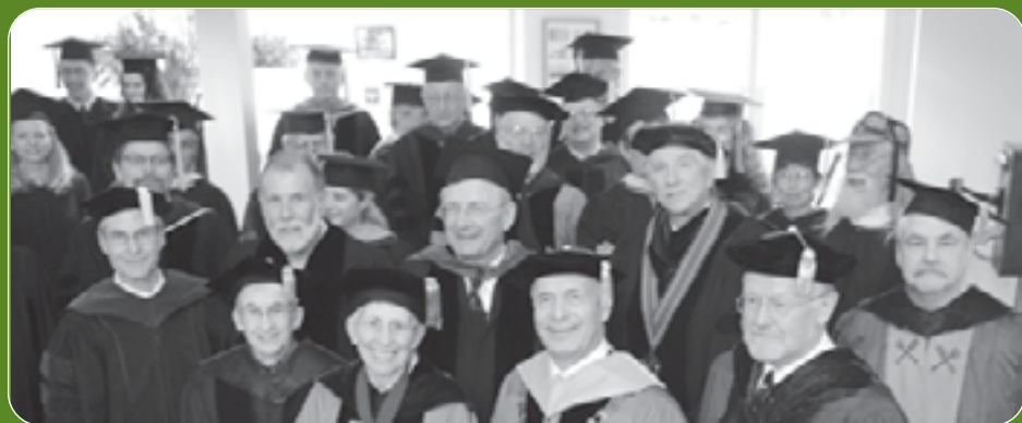
Participants pause for a photo prior to lining up for the procession.