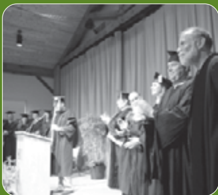
A central theme throughout was Unity's future.