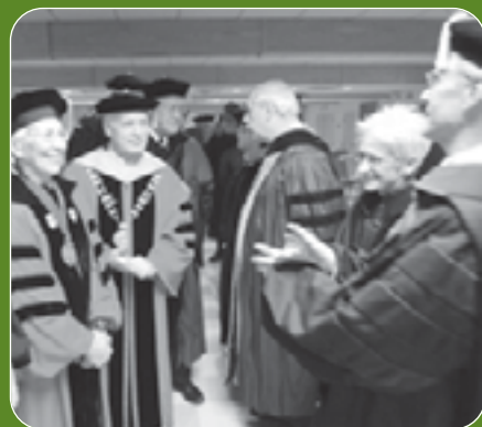
Ready for Inauguration.