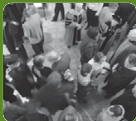
Guests mingle after the ceremony.