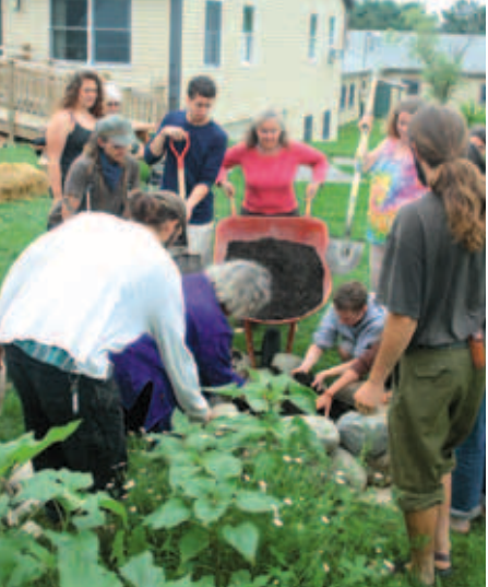
Earth Activist Training students pursue a hands-on, soil learning project. The comprehensive training focused on permaculture, which teaches how to weave green solutions together into systems that can meet human needs and regenerate the natural world.

The training was a rigorous permaculture design program that combined classroom lecture with small-group project design time and hands-on experiential learning. Students learned how to heal soil, cleanse water, and design human sys-