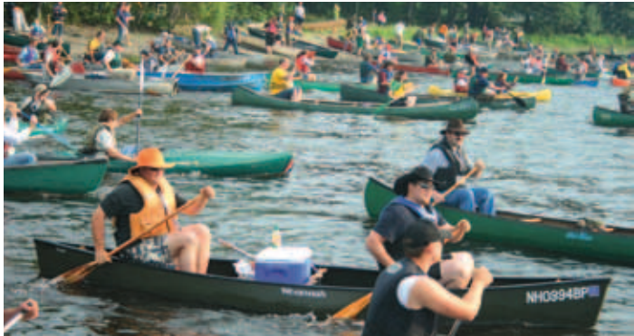
The seventh annual Fishing for Scholarships tournament kicks-off.

There were eleven additional students who won scholarships and prizes, bringing the value of all scholarships and prizes awarded to $29,000.