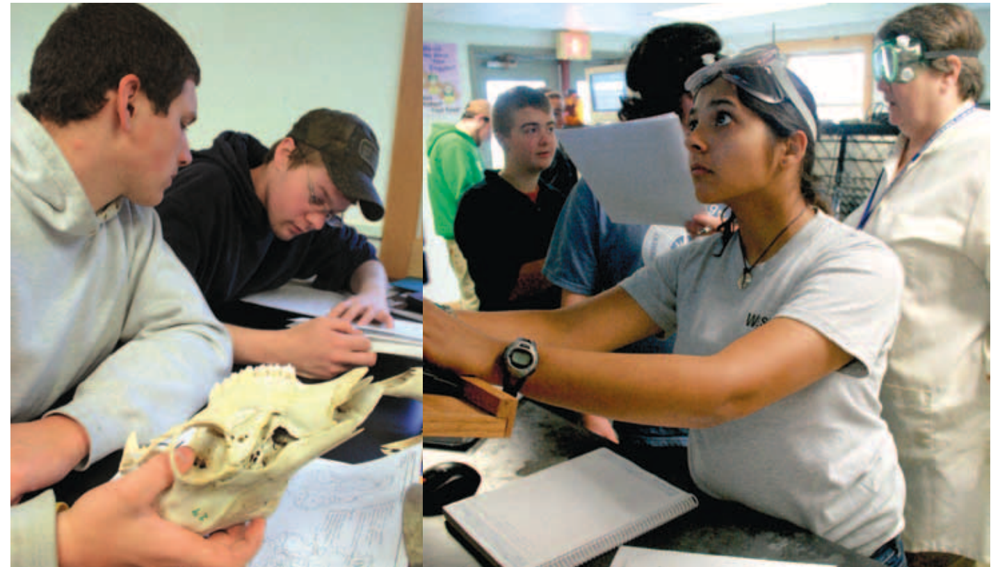
Students examining skull bones in a mammalogy class laboratory. And a chemistry student searches for information to solve a lab problem.

Also, visit The Owl Project www.owlproject.media.mit.edu and Maine Audubon at www.maineaudubon.org