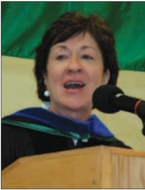
Senator Susan Collins

The entire text of the commencement address by Senator Collins is online at www.unity.edu/NewsEvents/News/UC-ComU509.aspx .