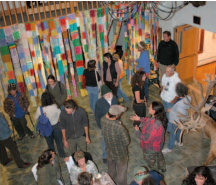
Patrons were treated to one of the most extensive set designs of any performance in UCCPA history. The Hurricane Season experience began the moment patrons entered the door with tapestries hung from the ceiling containing hand written messages and art work.