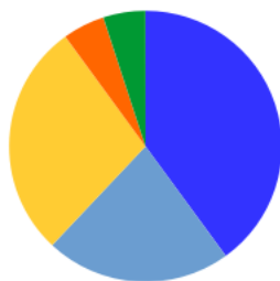
Unity FFF Target